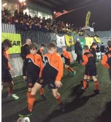
Our U12s warm up in front of the crowd

It was straight off the plane and into their opening game where they also faced the mighty Real Madrid. Putting in an excellent performance they came away with a very credible 0-0 draw.